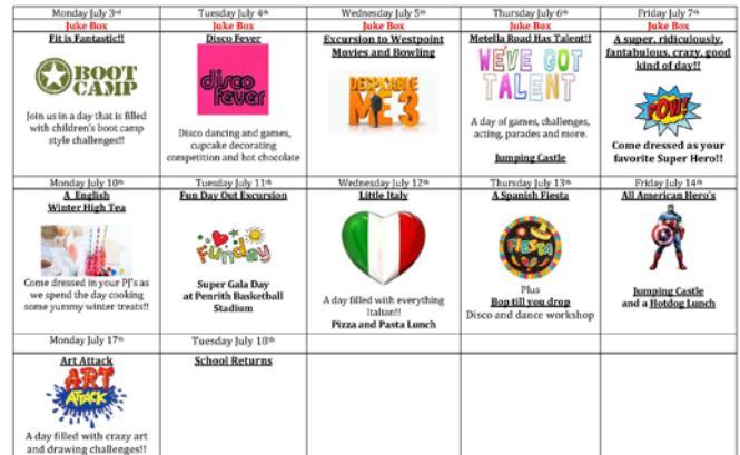
2017 July School Holiday Program

Enrolment forms to be returned to the Centre by Wednesday 14th June 2017.