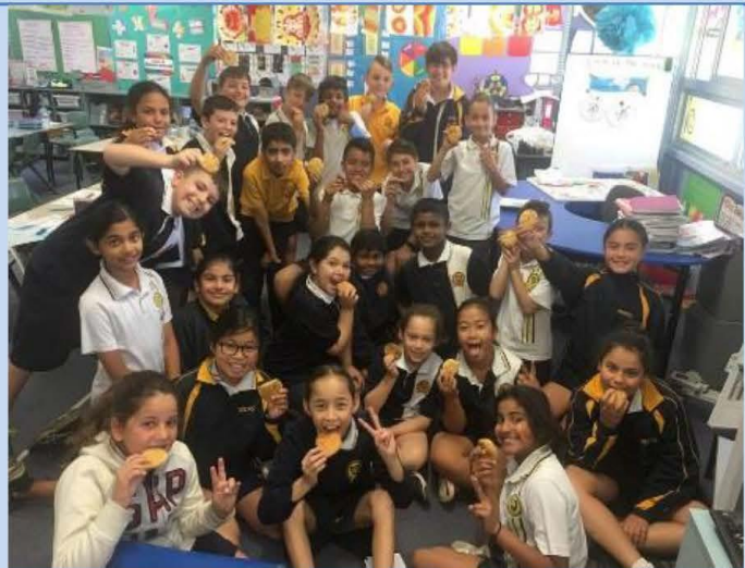
Below: 4J enjoying pancakes to show fractions.

3D are enthusiastic, engaged and thoughtful learners as they investigate, discover and create in their classroom each day. Recently 3D have enjoyed: