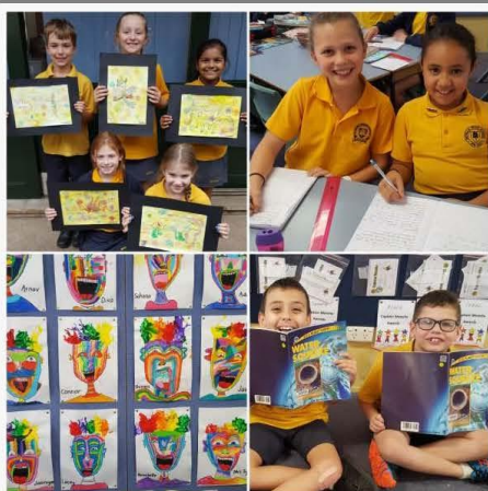
Above: A snapshot of 3F's action-packed term.

Our classroom has been full of action again over the past term! The students in 3F always strive for improvement, aiming high in all learning areas. We have been working hard in English, reading fluently and creating texts based around our modelled reading books, Food for Health and Water Squeeze . We have been working mathematically to extend our knowledge in Number and Algebra and Measurement and Geometry . The students particularly enjoyed using vertical algorithms to solve number problems and our unit on money. Visual Art continues to be a favourite lesson and our classroom is looking very colourful with many clever creations! We are learning to appreciate and self-evaluate our artworks this term. As teachers of 3F, we are so proud of the progress our students have made this year and appreciate having such a respectful, motivated and kind group of students to teach. Congratulations on a great year, 3F!