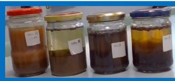
Above: Soils in Science