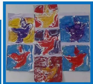
Above: Lino-Printing in Visual Art