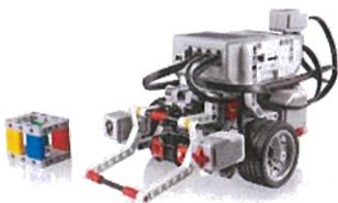
LEGO® Mindstorms® EV3

LEGO® Mindstorms® EV3 is the most advanced LEGO® robotics kit and is the preferred kit for national and international events.